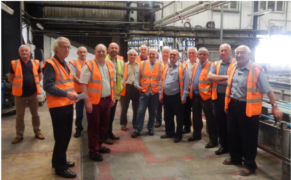
Photograph (from the left)

On the following day members enjoyed an organised rifle shoot and a narrow boat excursion.