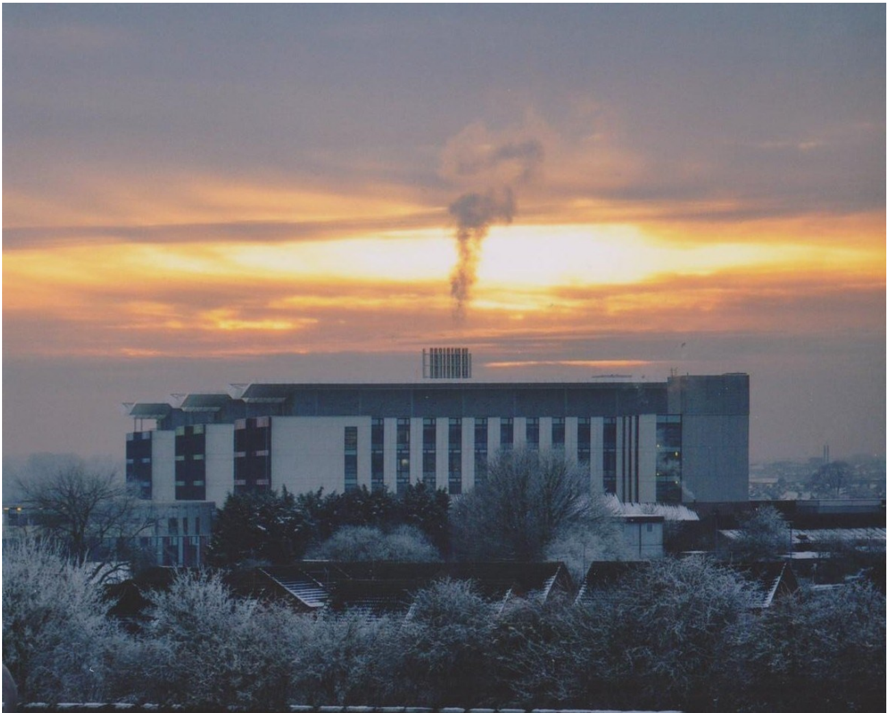
Sunrise above Kings Mill Hospital Mansfield